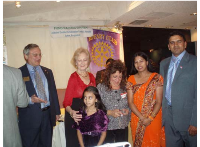
Club Rotary Let Feizza with District Leaders